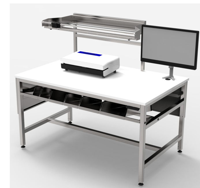
TS600 on upright partition