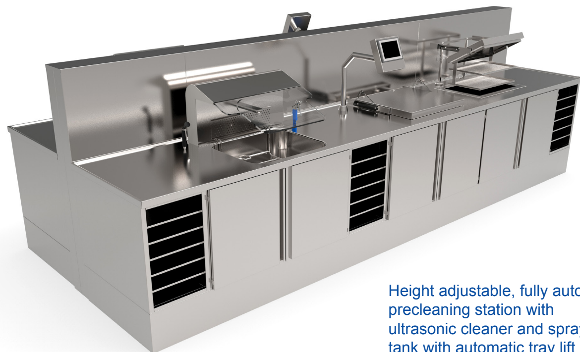
Height adjustable, fully automatic precleaning station with ultrasonic cleaner and spraying tank with automatic tray lift