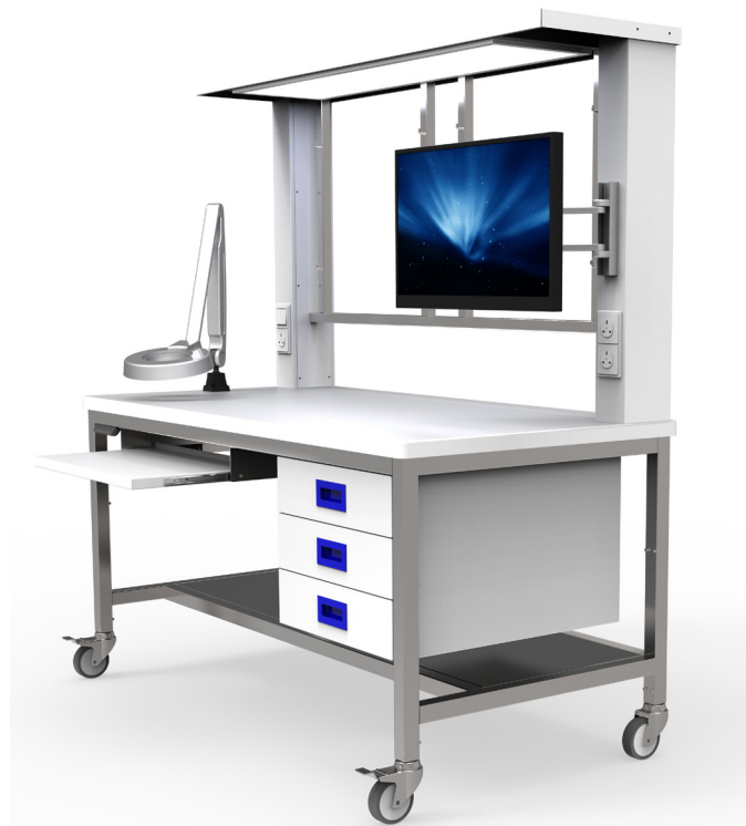
Height adjustable worktables